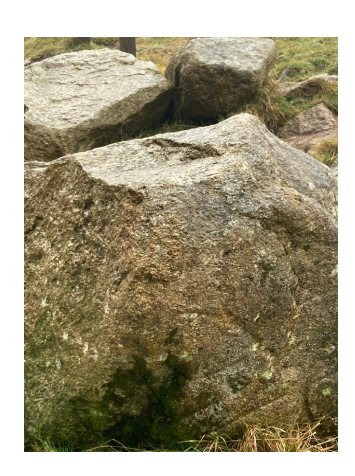
A massive rock or boulder