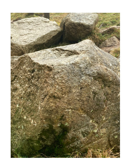
A massive rock or boulder