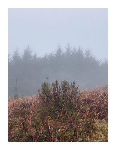
Mist, interesting clouds or other weather feature