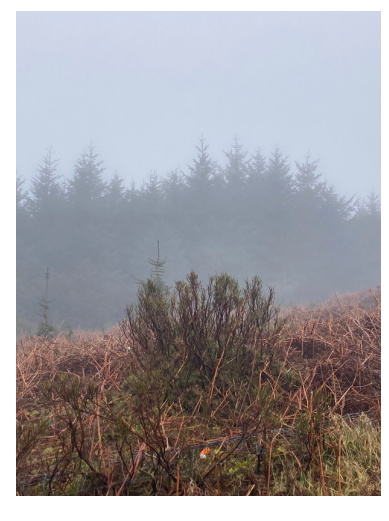
Mist, interesting clouds or other weather feature