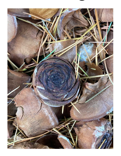
Interesting seed heads