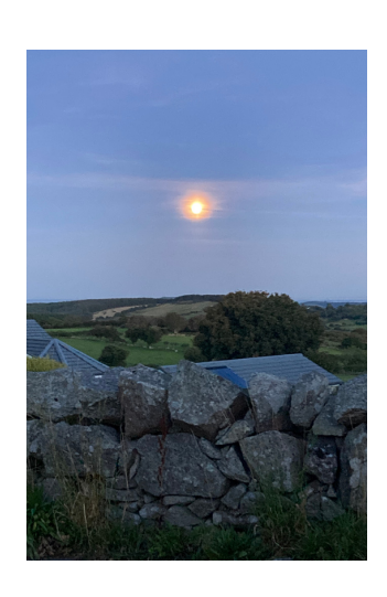
A stunning sunset