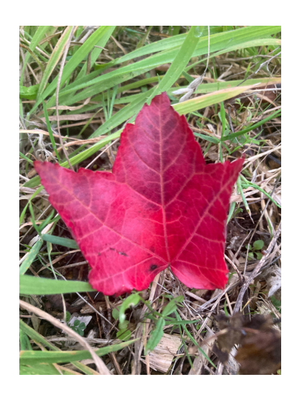
A bright red leaf