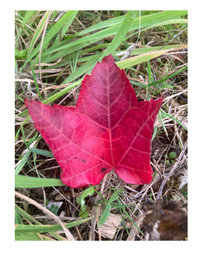
A bright red leaf