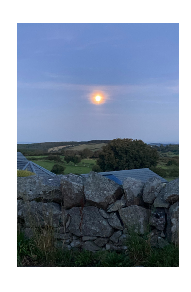
A stunning sunset