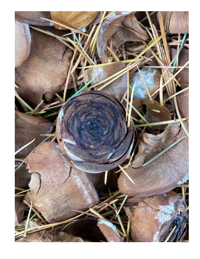
Interesting seed heads